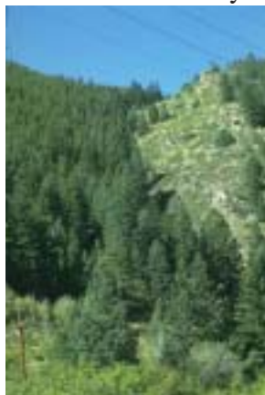
This location would become a natural chimney during a wildfire.