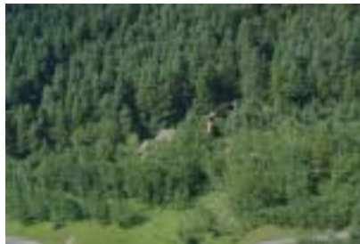
Probably not a wise location for a home.